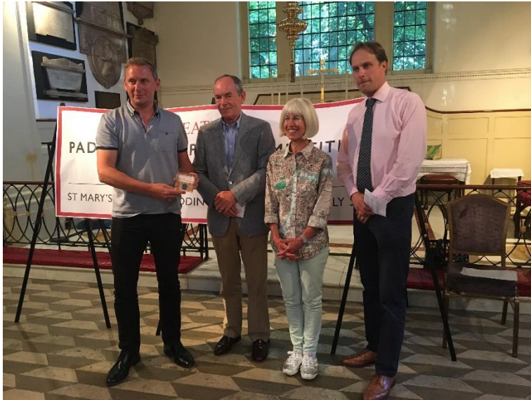
7 HLM*Spark receive their award