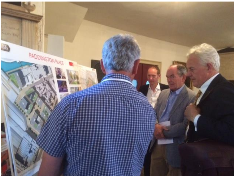
2 Sir Simon Jenkins is shown the winning JTP / Civic Voice Entry