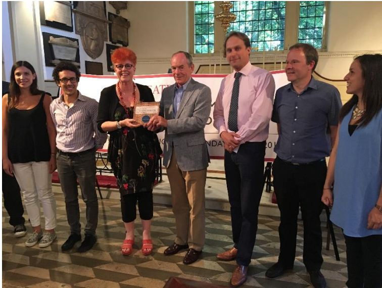
5 AR Urbanism & Greysmith Associates receive their award