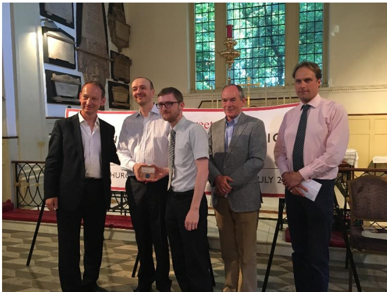
6 Architettori receive their award