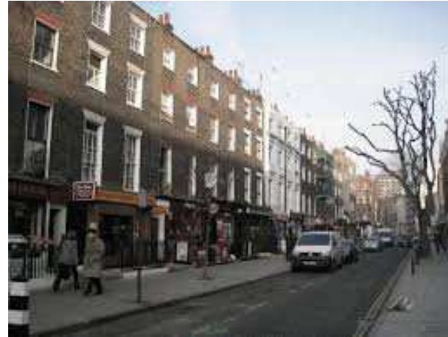
10. Marchmont Street, London