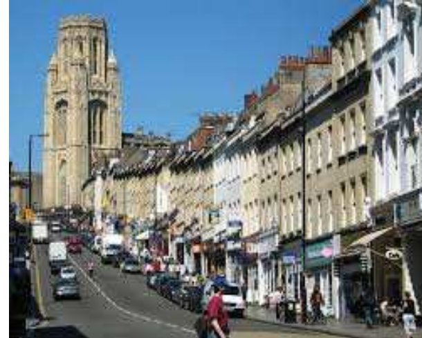
14. Park Street, Bristol