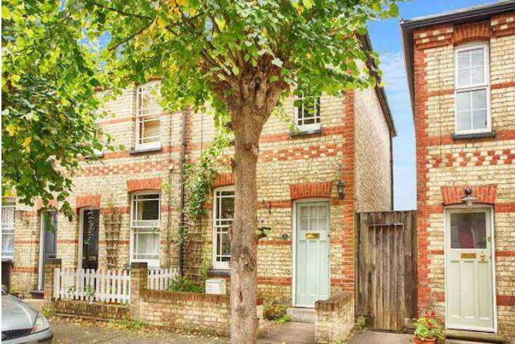
13. Oster Street, St Albans