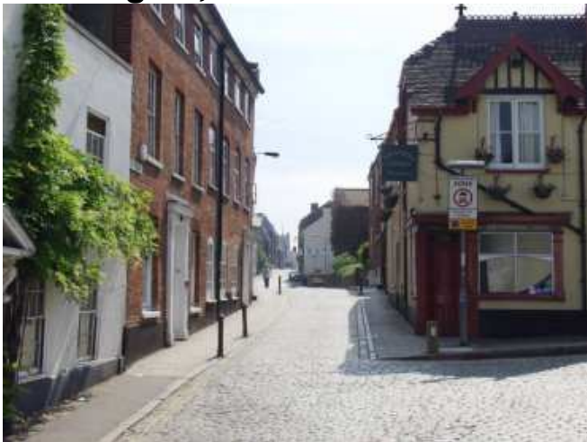
15. Pottergate, Norwich