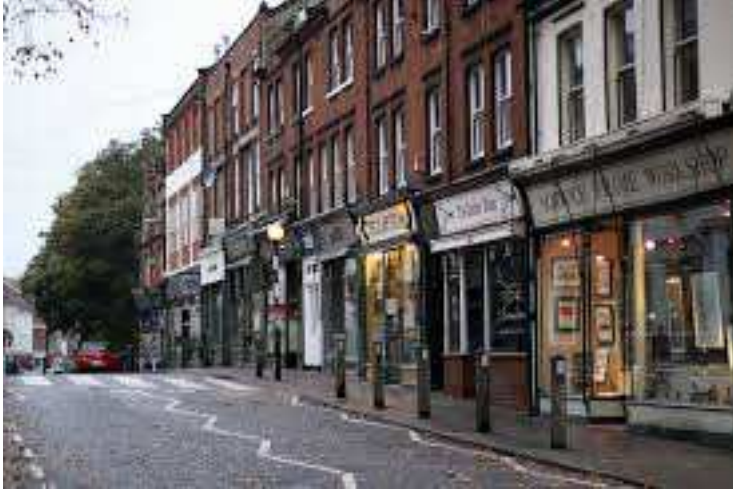
21. St Benedict's Street, Norwich