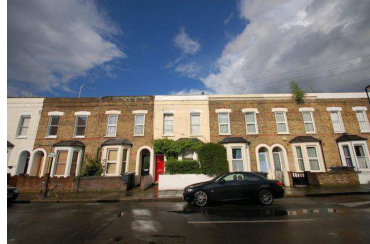
22. Tintern Street, London SW4