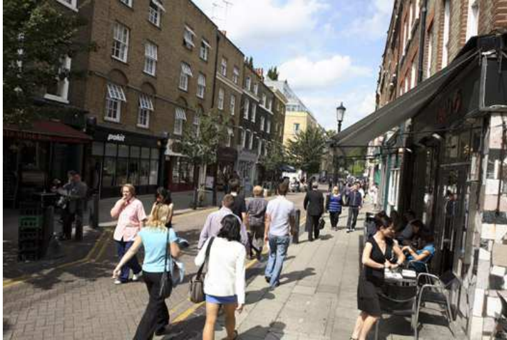
9. Lamb's Conduit Street, London WC1