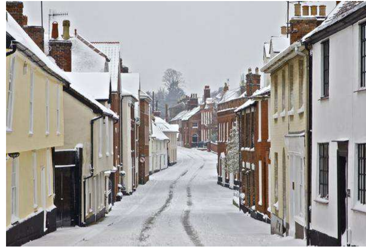
2. Cumberland Street, Woodbridge, Suffolk