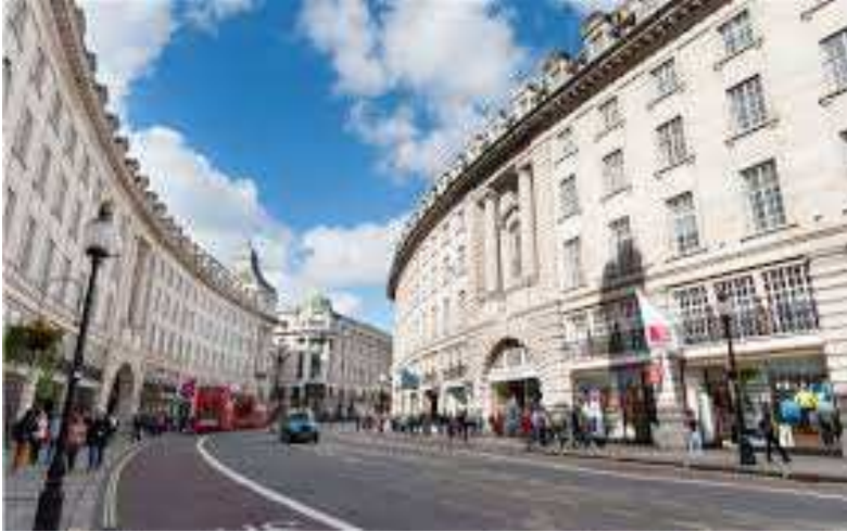
17. Regent Street, London