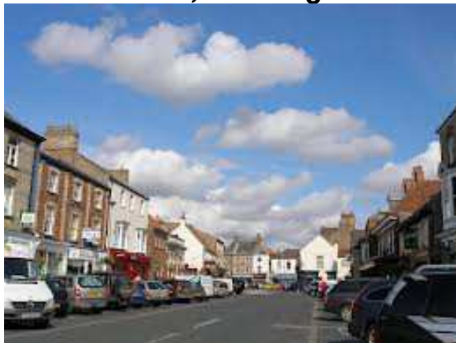
11. Market Place, Pocklington