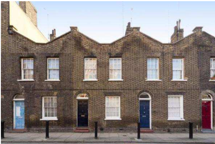
19. Roupell Street, London SE1