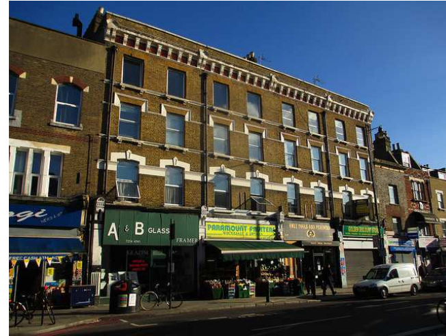
6. High Street, Stoke Newington N16