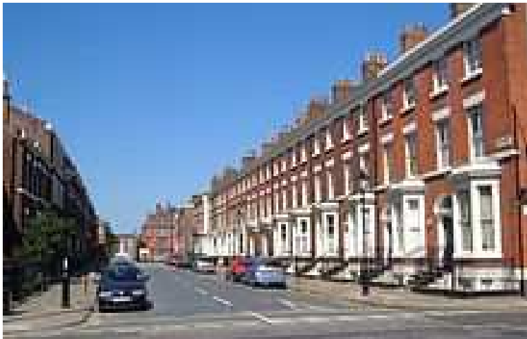
3. Falkner Street, Liverpool