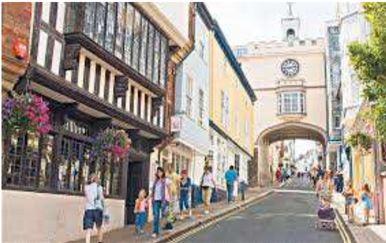
7. High Street, Totnes