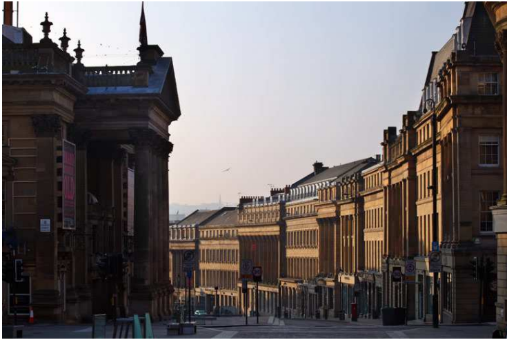
5. Grey Street, Newcastle