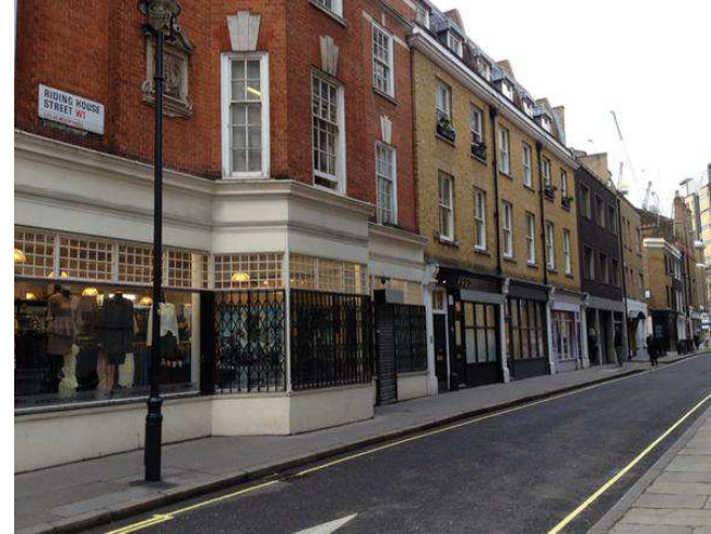
18. Riding House Street, London W1