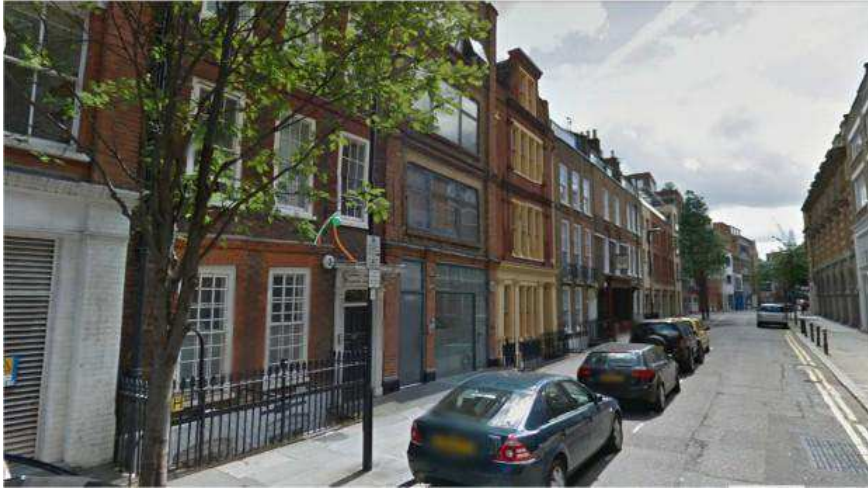
1. Britton Street, London